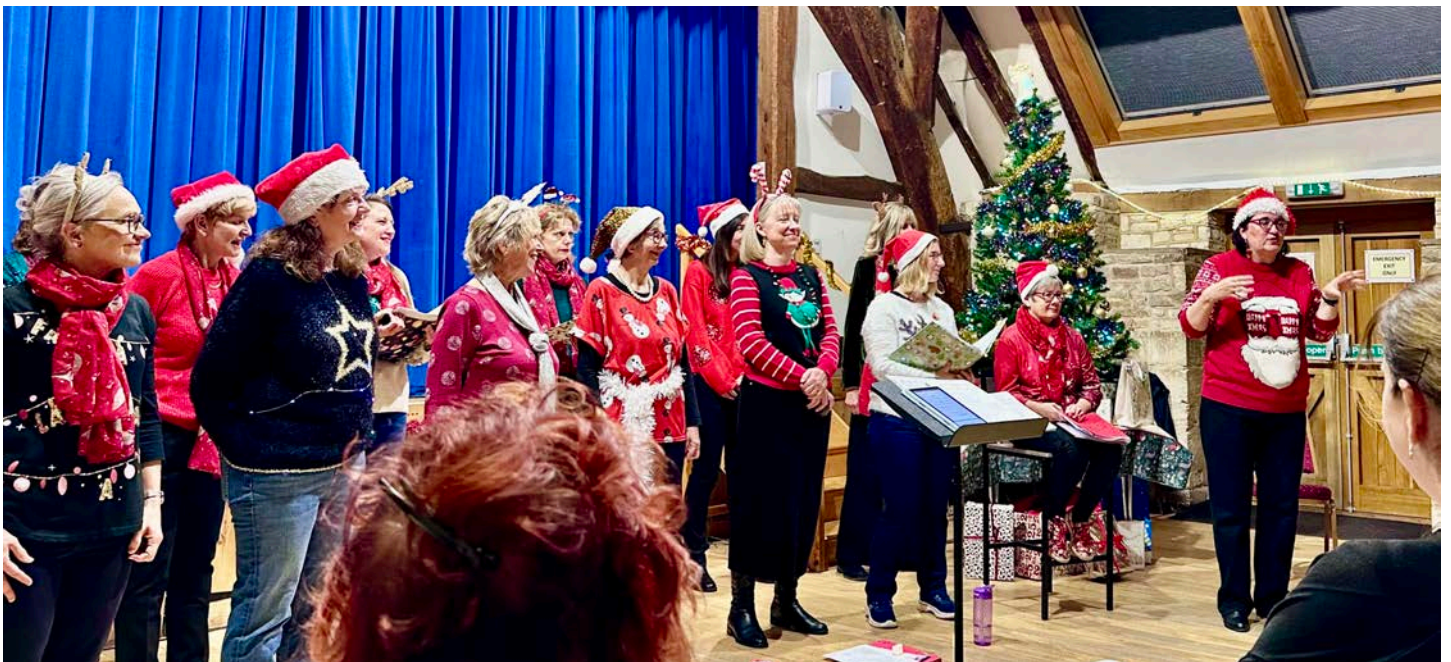
Cleeve Harmony spreading Christmas joy at Tithe Barn