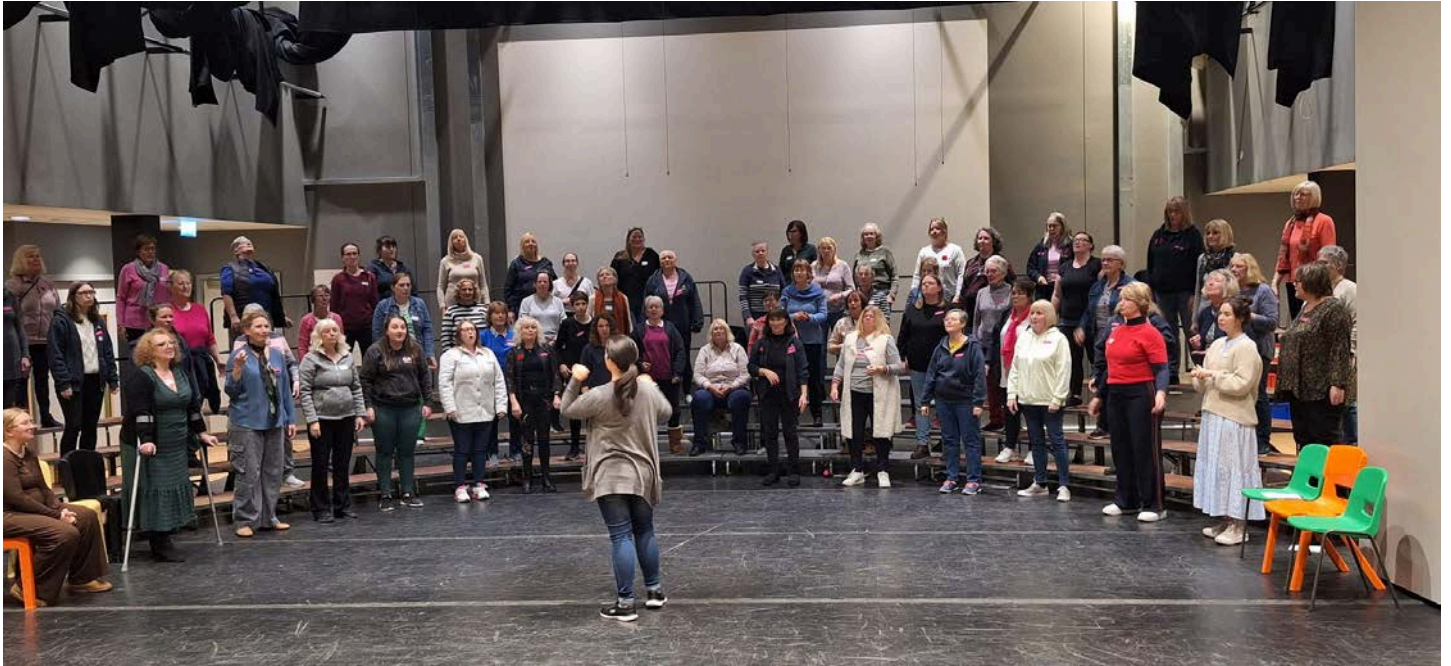
Advent acappella rehearsal