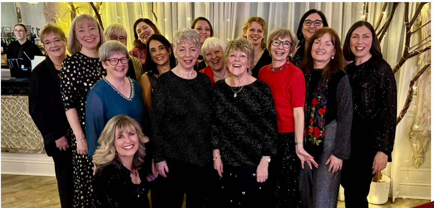
Cleeve Harmony at their glam moment - celebrating their highs and lows and looking ahead to whatever the future holds