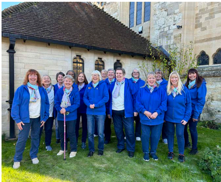
Outside the church at Stony Stratford after the Third Thursday at Twelve Thirty Club club performance

January started off with our New Year social dinner, with quizzes, a raffle and awards to members of Junction 14 who