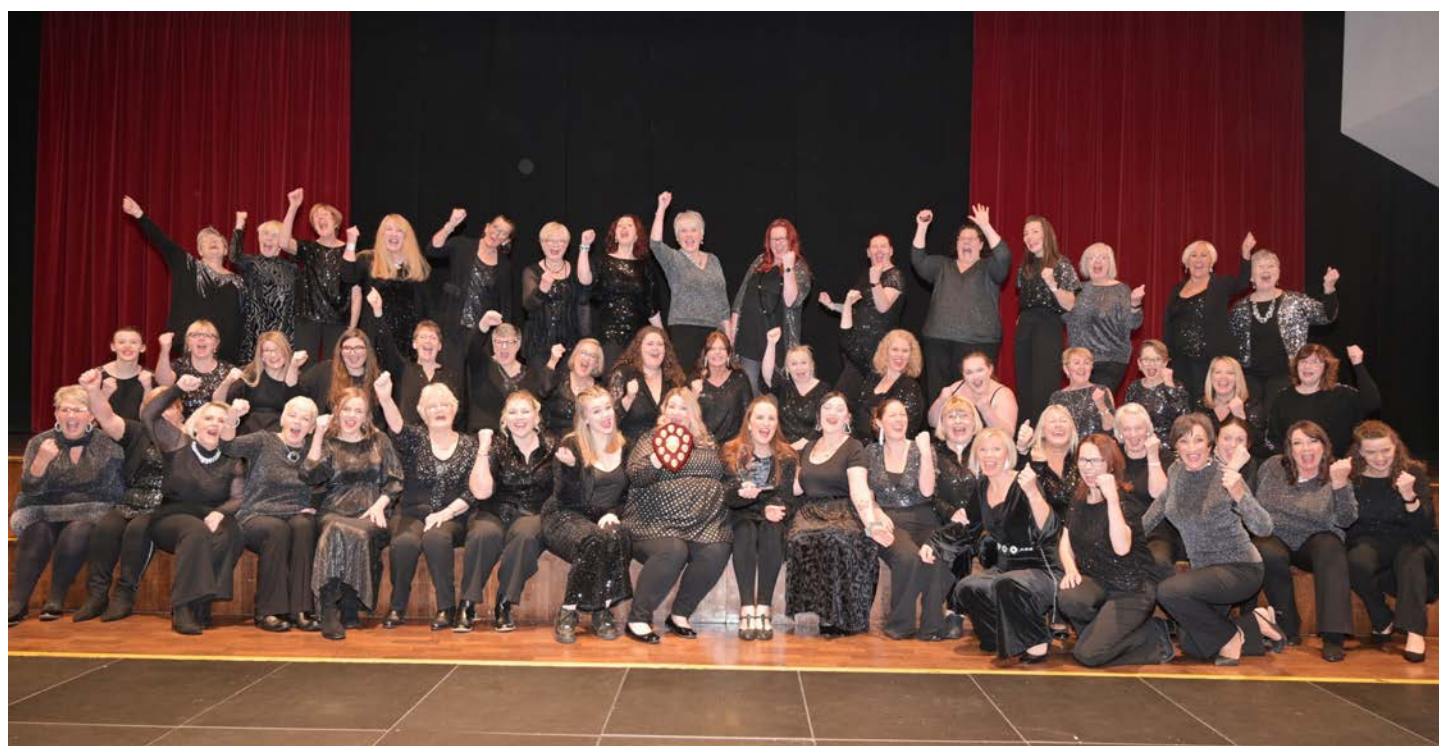
Victory for the Red Rosettes