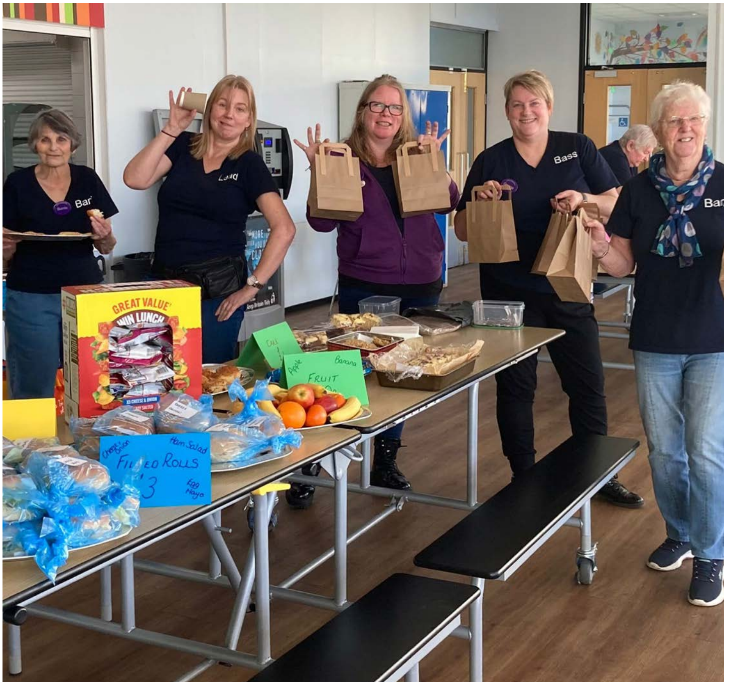
GEM Catering Weekend