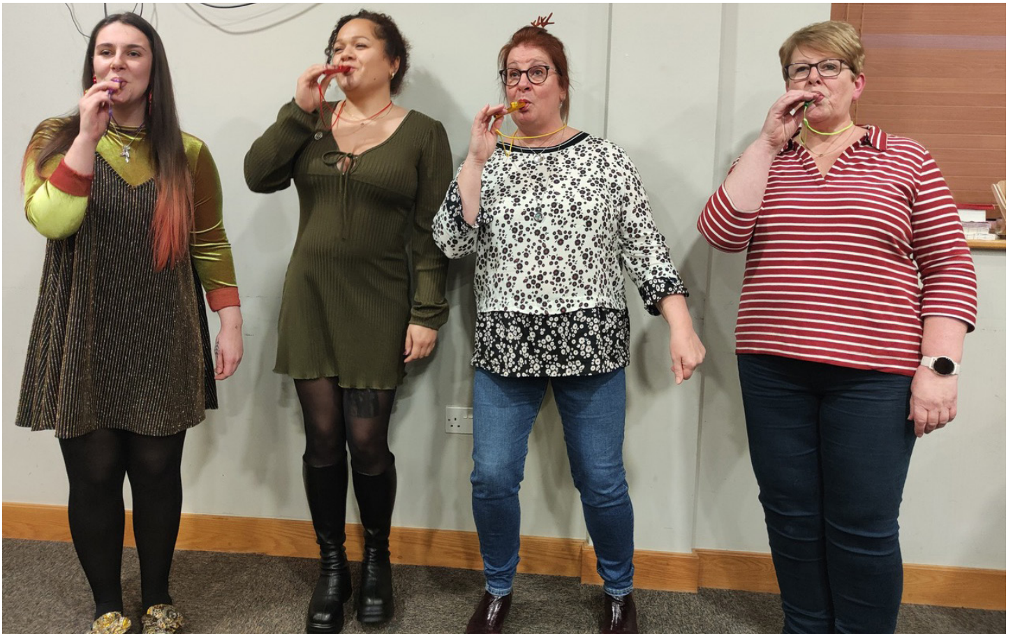
Rooftop Social Club having fun at the Fuddle