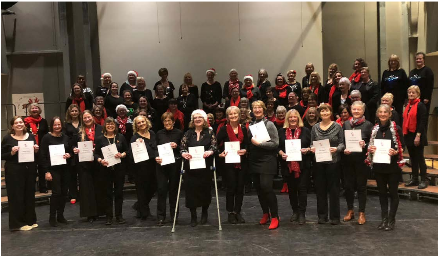
Spinnaker chorus, featuring the Advent Acappella participants with their certificates