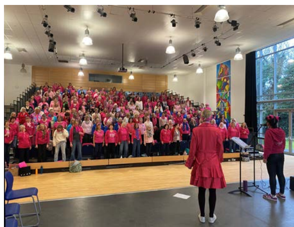
The whole crowd