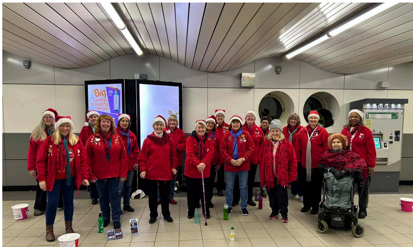
Junction 14 at Milton Keynes railway station concourse