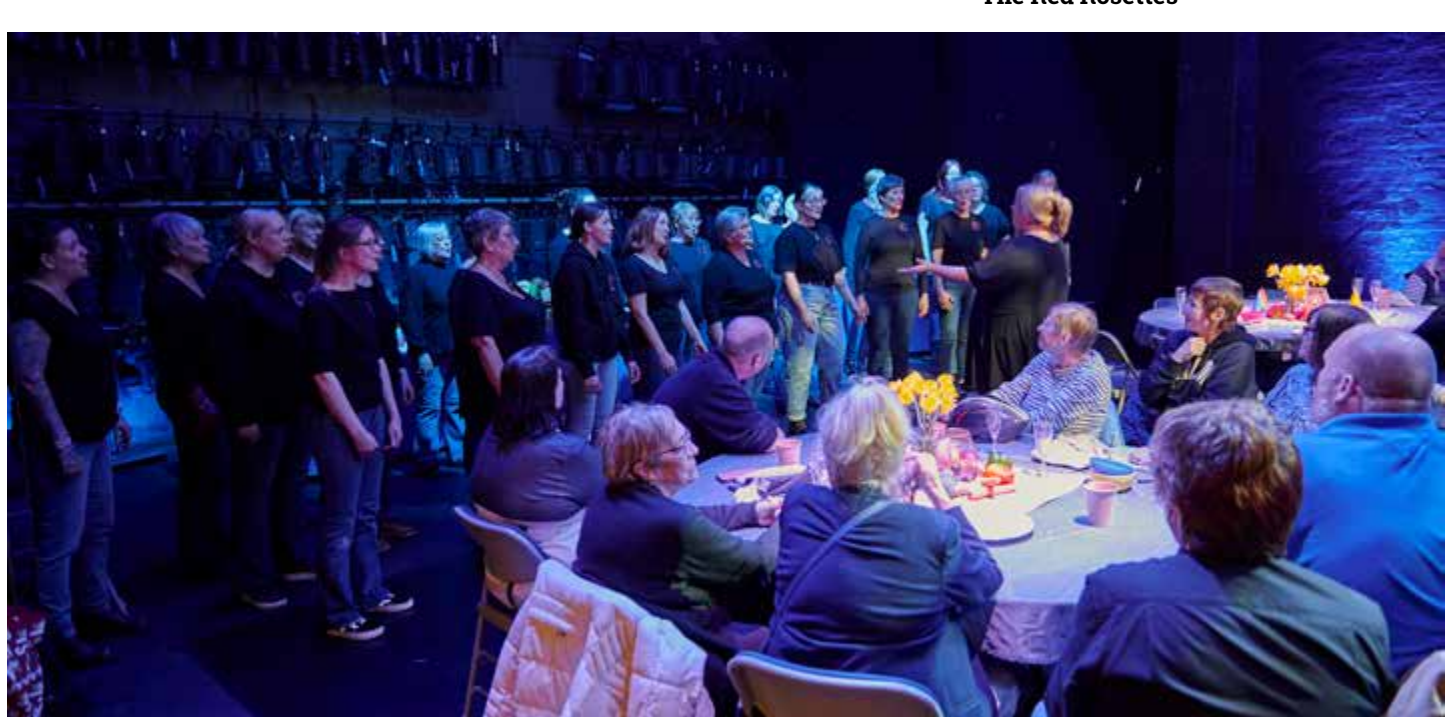
The first night of our Learn to Sing course