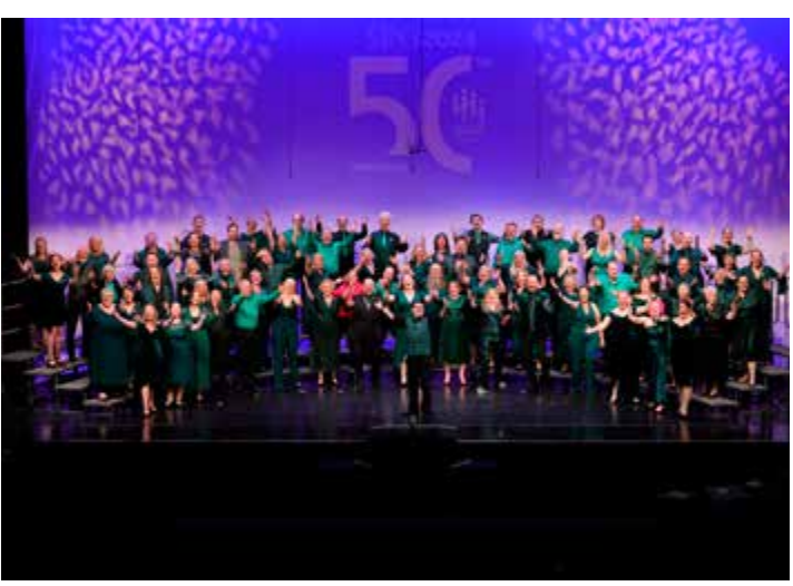
Mixed Chorus Champions, Crucible Vocal Project