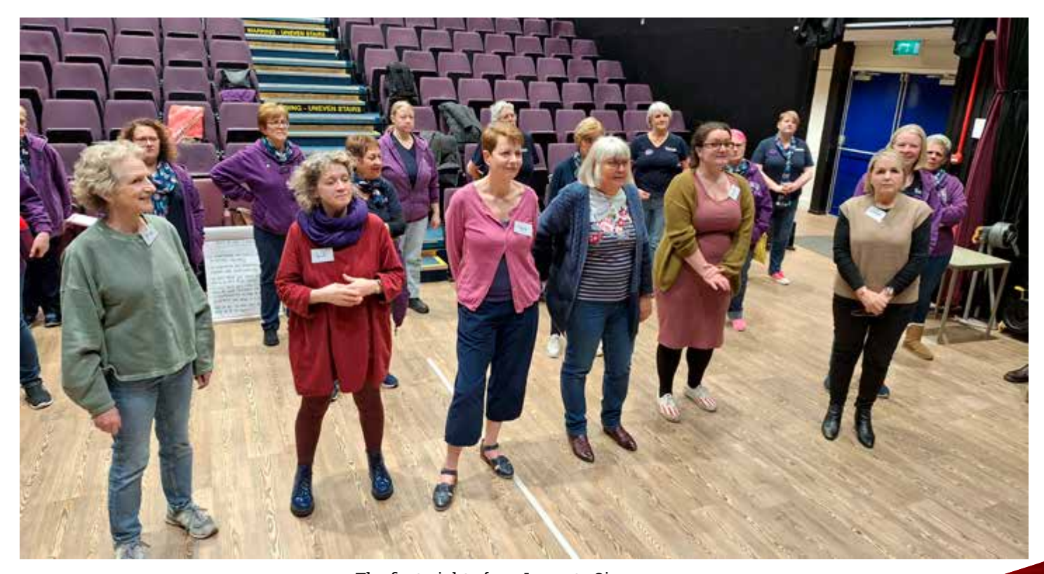
The first night of our Learn to Sing course