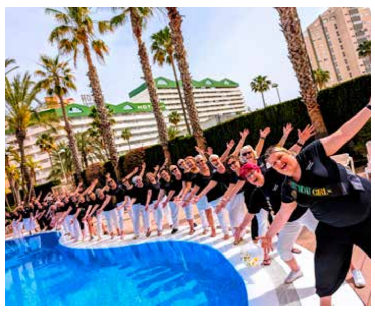
The Crystals having fun in the sun