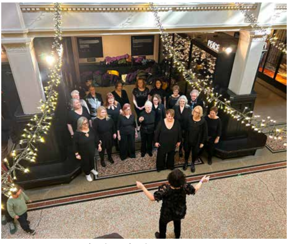
Performing at the Dinosaur Museum