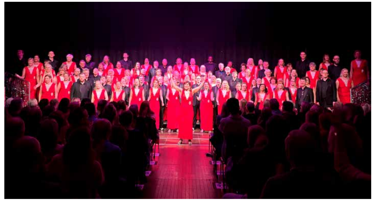
A Kind of Magic with Cottontown Chorus