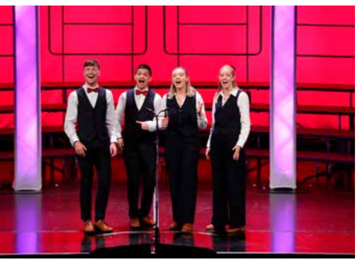
Youth Quartet Champions, Ami Quartet