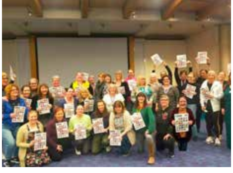
Harmony Hotshots: Sang with everyone else in the other three parts