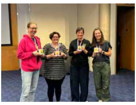
Third Place quartet, Best for Last