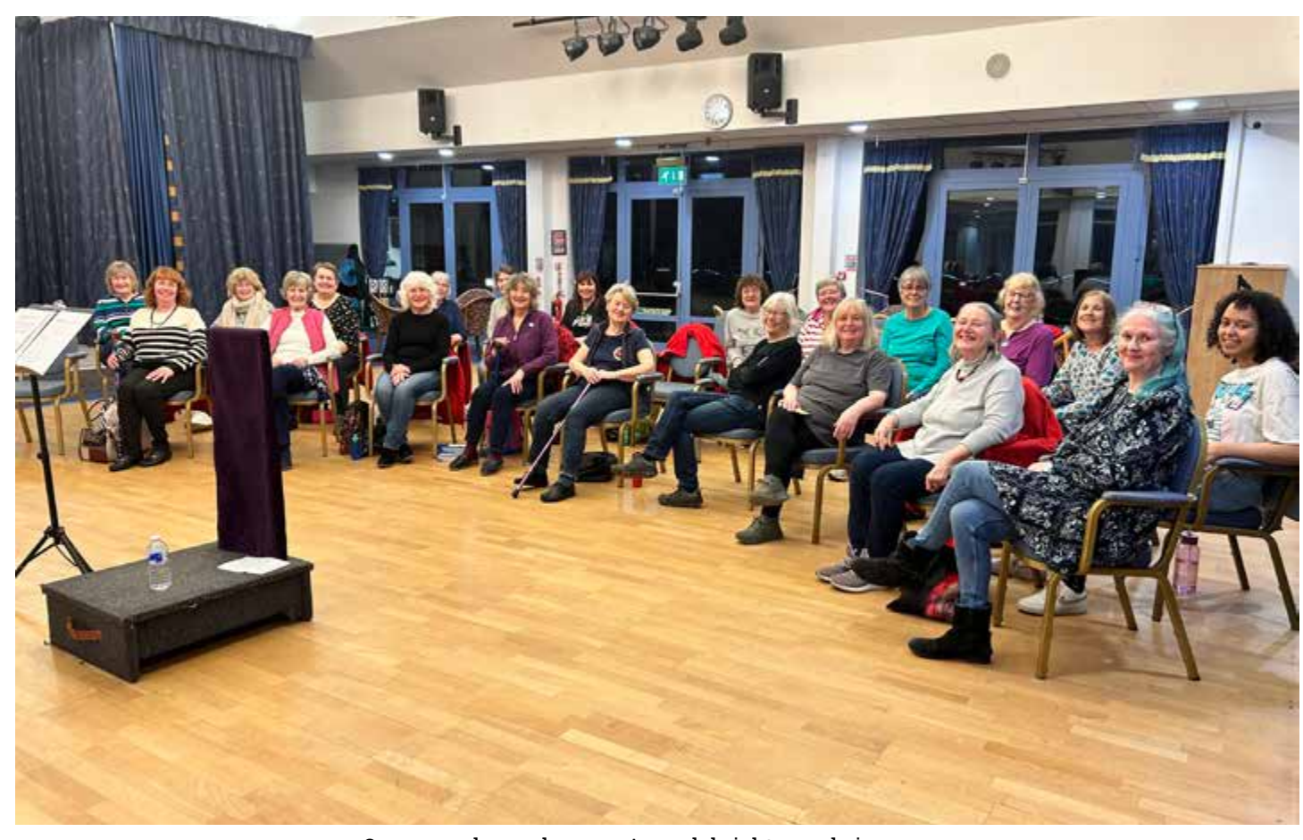
Our new rehearsal venue. A much brighter and airy space.