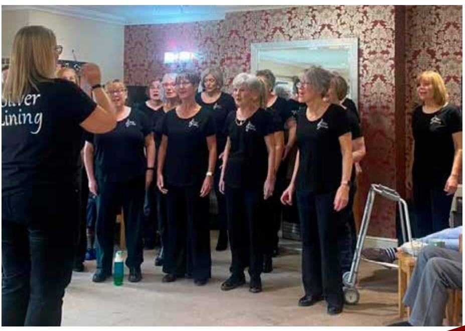
Silver Lining at Herald Lodge