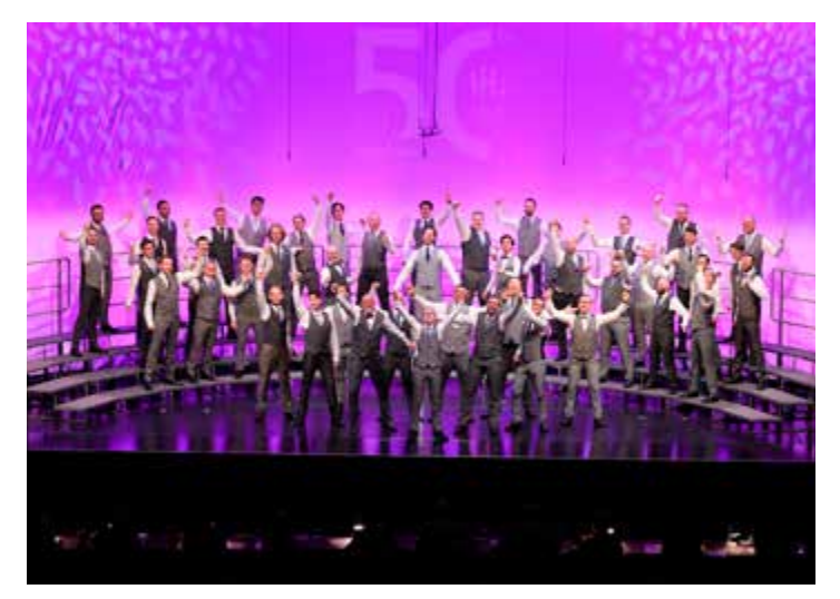
Male Chorus Champions, Meantime Chorus