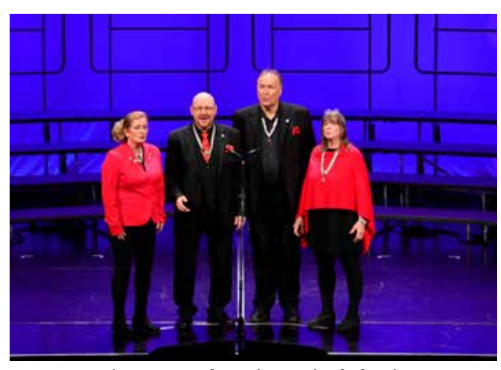
Senior Quartet Champions, Mixed Blessings

BABS hosted their marvellous Sing 2024 Convention at the end of May. It was such a wonderful event, with barbershoppers from across the UK (and beyond!) coming together to help BABS celebrate their 50th Anniversary year. Congratulations to everyone who crossed the stage, and sincere thanks to the army of BABS volunteers who worked tirelessly to make the weekend so memorable.