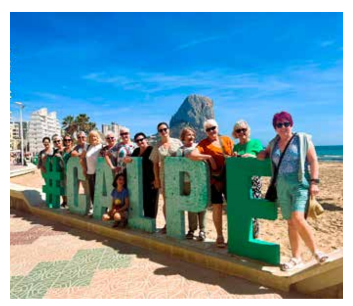
Just like LABBS' Convention 2023, but with sun!