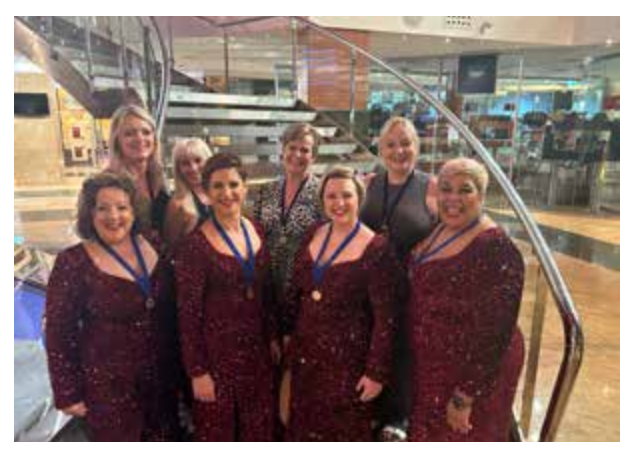
In House and Barberlicious

After our busy couple of days, it was only fair to unwind and enjoy some fun in Benidorm! With its vibrant nightlife, there was no shortage of options for excitement.