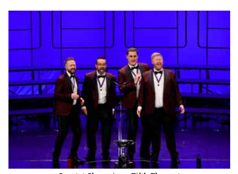
Quartet Champions, Fifth Element