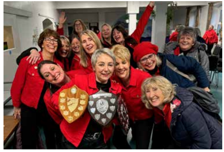
Red Rock A Cappella are delighted with their three awards!